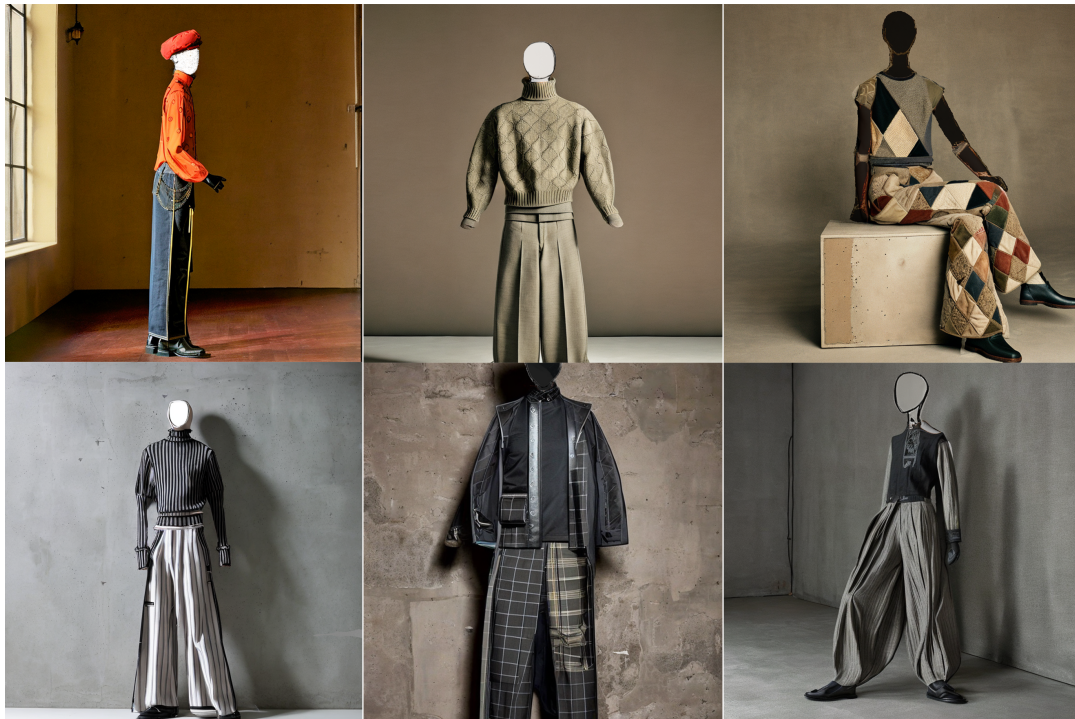
Figure 5: Final post-processed images showcasing the integration of AI-generated garments with the original mannequin sketches, achieving the desired aesthetic.

by McKercher’s (2020) co-design principles. This collaborative approach between fashion designer and AI technologist aligns closely with our research questions, addressing how AI can enhance and guide creative workflows, facilitate ethical data usage, and support sustainable practices. Using small data and reducing the need for physical prototypes, similar to Zhang, Zhang, and Xie (2024), this approach aims to minimise waste and promote environmentally conscious design practices.