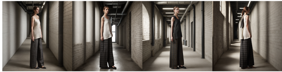
Figure 3: Designer sketch next to photorealistic outputs generated by the original realistic-vision-v51 model (upper row) versus the fine-tuned model (lower row), showcasing the impact of fine-tuning on backdrop structure, textures, and lighting.