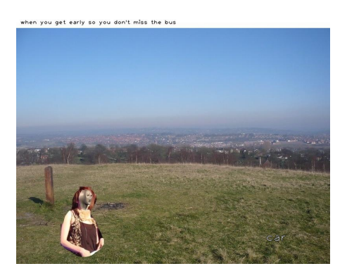
Figure 8: Meme generated with the input "When you get early so you don't miss the bus".

Lastly, the final image composition is created by adding the action description at the top of the image and pasting the returned word on the final output (as seen in Fig. 7) with the help of an MSER detector (Matas et al. 2004), which returns regions of the image to place the word. During the testing