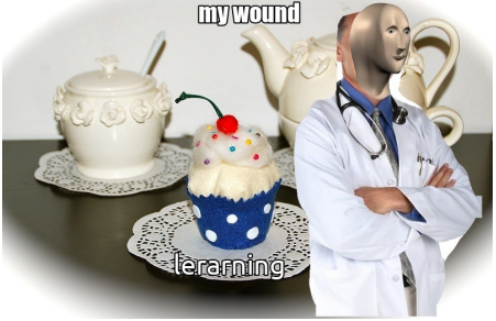
Figure 14: Meme generated with the input "When the school doctor applies a cup of tea to my wound".