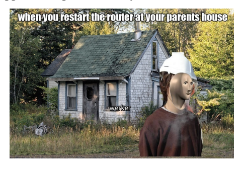
Figure 15: Meme generated with the input "When you restart the router at your parents house".

in different formats, it was observed that some key features could be added to make the output more appealing. The improved work was made iteratively and its evolution can be seen in Figures 9, 12 and 16, corresponding to the first, second and third iteration of Stonkinator , respectively.