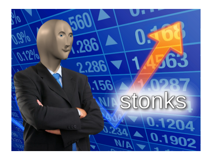
Figure 2: Stonks meme

<sup>3</sup>https://colab.research.google.com/github/robgon-art/aimemer/blob/main/AL_Memer.ipynb