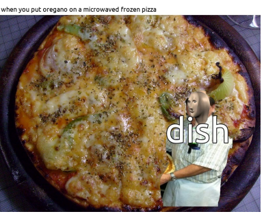
Figure 13: Meme generated with the input "When you put oregano on a microwaved frozen pizza".

lated to the wide variety of results for the same input, which may indicate some degree of creativity. We also consider that the high level of unpredictability is not an issue since, as seen in Table 3b, the participants stated that they would use the produced memes in a social media post or an informal text conversation. Lastly, according to user feedback, another important element to be improved was the typography. Both sentences were sometimes hard to read on a smartphone and sometimes even on a computer, as such, it's a detail that needed to be addressed.