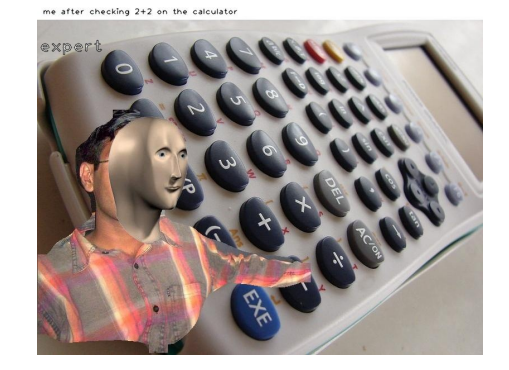
Figure 11: Meme generated by a participant with the input "Me after checking 2 + 2 on the calculator".

To obtain this data, the participants were presented with a couple of tasks and were asked to answer a series of questions related to the tasks they performed and the results obtained. The testing process started by providing users with access to the website and asking them to create a meme by introducing a sentence as input, created by the participants (e.g.: "I like to eat marmalade with cheese", Fig. 10). After that, they were presented with a set of three images, each image blended with a different method, and next, the second task was to save the set into the system if they found the meme interesting, to be displayed in the website's gallery. With this step completed, the third task asked the participants to generate another meme using the same input, and once again, the next task was to save the generated set if they wanted to. In the end, they were given the option of answering a questionnaire or continuing to use the system freely and answering later. Before answering any questions, the participants were asked to choose a set of images that they created and open it in a new window to use later in the questionnaire. The questionnaire was designed using Google Forms with the goal of studying the topics already mentioned. Users were guided through the tasks and any