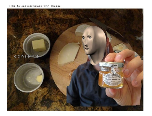
Figure 10: Meme generated by a participant with the input "I like to eat marmalade with cheese".