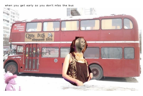
Figure 9: Meme generated with the input "When you get early so you don't miss the bus".

phase, the font type was the default and the font size was fixed for both the description and the returned word (Figures 8, 9, 10, 11). For the current state of the system, the output comes with its caption and text written in different fonts and sizes, being this process specified in the Improved Work section.