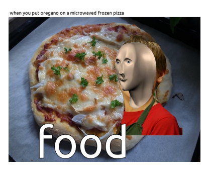
Figure 12: Meme generated with the input "When you put oregano on a microwaved frozen pizza".

One of the biggest criticisms regarding the technical quality of the generated memes was the image segmentation part, where it failed to detect accurately the borders of human figures in the image, being, therefore, a starting point to improve the system. A fact that may be in favour of these flaws is related to the existence of memes whose objective is to have these same flaws intentionally displayed on the image,<sup>7</sup> although it's not the purpose of the system. This fact may also explain why users tend to prefer simpler pasting blending methods, rather than more complex ones, according to Table 3c, since several memes were made by simply pasting elements on an image. In Table 3a we can check that the predictability of the image obtained is very low. Since the purpose of the system is to create an image capable of conveying an idea or showing a reaction close to the one intended by the user, but also create different images each time the system produces an output, we can observe that the system often produces images with a high level of unpredictability. Users reported that the generated output conveyed the message they wanted to transmit. Taking this into consideration, we interpret that the high level of unpredictability may be re-