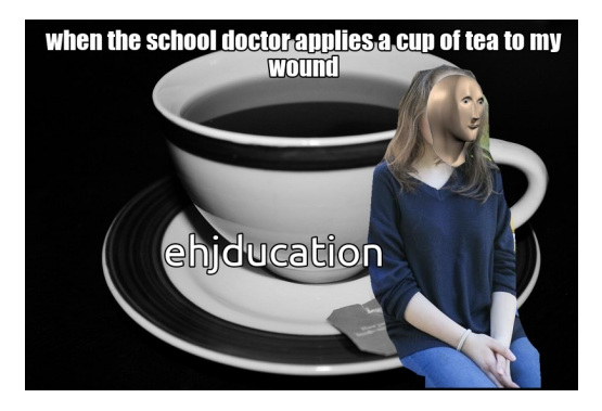
Figure 1: Meme generated by Stonkinator with the input "When the school doctor applies a cup of tea to my wound".

The growing use of memes (Kostadinovska-Stojchevska and Shalevska 2018) has led to the development of multiple tools that help to create memes, e.g. Imgflip's MemeGenerator. Existing meme-generation systems usually allow the user to produce multiple types of output, making it difficult to determine the genre to which the meme belongs and understand how it should be used. In addition, different meme templates exist and not all have the same degree of complexity: some are based on a structure that has always the same background image and only the text is changed; others have a structure in which both the imagery and text are changed. In the field of Computational Creativity, there are already