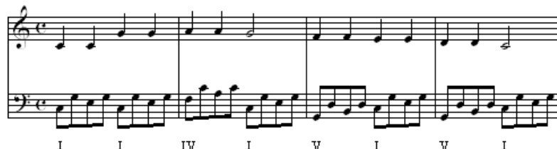
Fig. 5. Composition. An arpeggiated harmony for “Twinkle, Twinkle Little Star”.

pieces that will yield useful clusters, possibly through a trial-and-error weighting of the inputs and manual inspection of the resulting clusters.