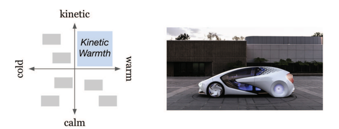
Figure 1: Left: character space for "kinetic warmth." Right: design derived from "kinetic warmth" (© 2021 Toyota Motor Sales, U.S.A., Inc.).

We present a pilot study of an AI-assisted search tool, the "Design Concept Exploration Graph" ("D-Graph"). It assists industrial designers in creating an original design-concept phrase (DCPs) using a ConceptNet knowledge graph and visualizing them in a 3D graph. A DCP is a combination of two adjectives that conveys product semantics and aesthetics. The retrieval algorithm helps in finding unique words by ruling out overused words on the basis of word frequency from a large text corpus and words that are too similar between the two in a combination using the cosine similarity from ConceptNet Numberbatch word embeddings. Our pilot study with the participants suggested the D-Graph has a potentially positive effect, though we need to improve the UI to help users adhere to the use of the algorithms in the intended ways.