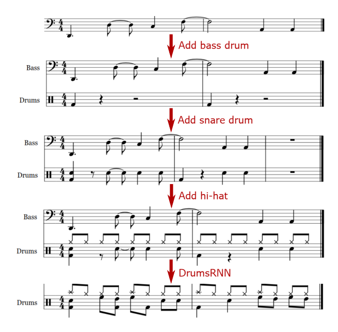
Figure 1: Building the drum beats. From top-to bottom: starting from a specified bassline, bass drum notes are added on the first beat of each bar, snare drum notes are added for each bass-note onset, and finally hi-hat notes are added at each 8th note. This deterministic drum beat can then be sent as a 'primer' to DrumsRNN which will generate a new beat.