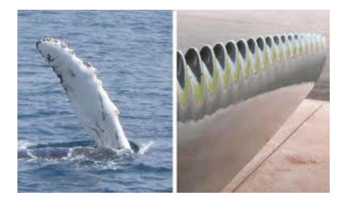
Figure 1: Design of windmill turbine blades to increase efficiency inspired by the tubercles on humpback whale flippers. (The Biomimicry Institute 2011)

channels of water flowing over them. The whales thus can move through the water at sharper angles and turn tighter corners than if their flippers were smooth (Fish et al. 2011). When applied to wind turbine blades, they improve lift and reduce drag, improving the energy efficiency of the turbine.