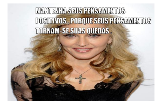
Figure 2: Meme generated for the pop singer Madonna. The text translates to Keep your thoughts positive, because your thoughts become your falls.

We should stress that the classifier is still in an early stage of development. In the future, instead of relying only in the black-box text classification of Mallet, additional features should be integrated, including a subset of those used by others (Sjöbergh and Araki, 2007b; Mihalcea and Strapparava, 2006). Moreover, we are aware that we cannot expect much of the current classifier, at least for the kind of sentences we are generating. While it was trained with classic and timeless jokes, understanding the generated sentences requires not only general world knowledge, but further information that may be valid only on a specific moment in time.