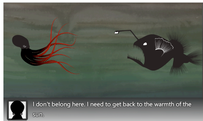
Figure 2: The screen shows the player's character (left) in a microinvalidation encounter with an NPC (right).

shown in Figure 2. While such questions may seem benign, they can also covertly imply the theme: "You are an alien in your own land" (such might be encountered by an Asian American in the United States). The player responds by using gestural input such as pinching out for an open/oblivious attitude or pinching in for a closed/aggressive attitude. Each encounter plays out according to a conversational narrative schema based on sociolinguistic studies of narratives of personal experience.